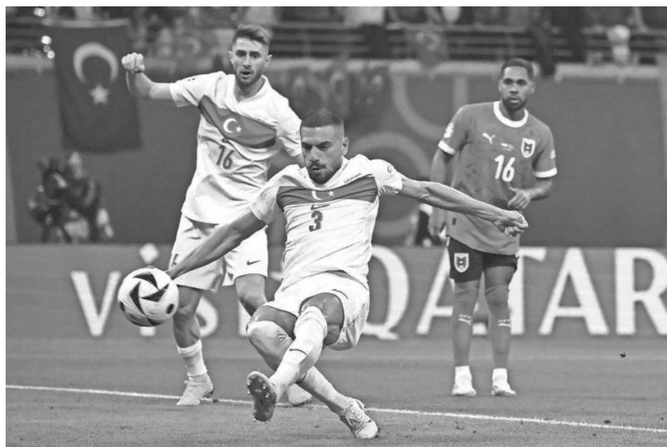
Defender Merih Demiral shoots and scores Turkey's first goal in the Euro 2024 round of 16 game Tuesday against Austria.