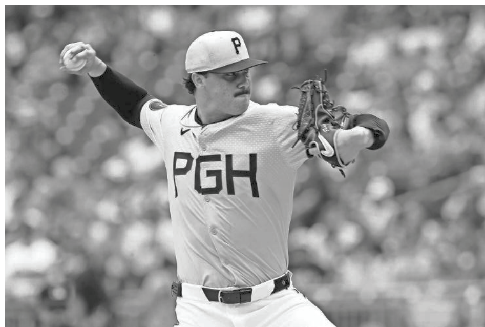
Paul Skenes was the No. 1 pick in the 2023 draft.

most exciting pitching prospect in 15 years has something of an incomplete grade, since he was summoned in May and his stats after eight starts are more befitting the one-fourth mark than the halfway point.